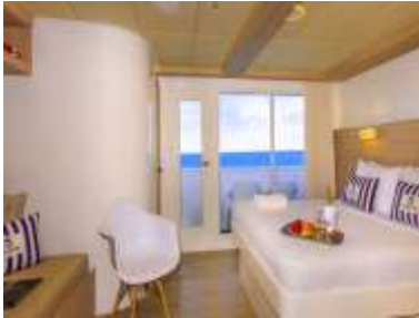
Size suite: 36m 2

1 Ocean View Master Suite with 2 balconies, 8 ocean view Junior Suite cabins with balcony and private bathroom, hot water, air conditioner, security box.