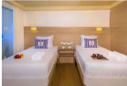
Size standard cabin: 18m 2