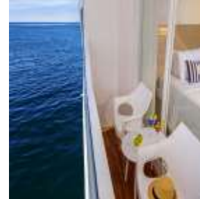
Size each balcony: 2m 2